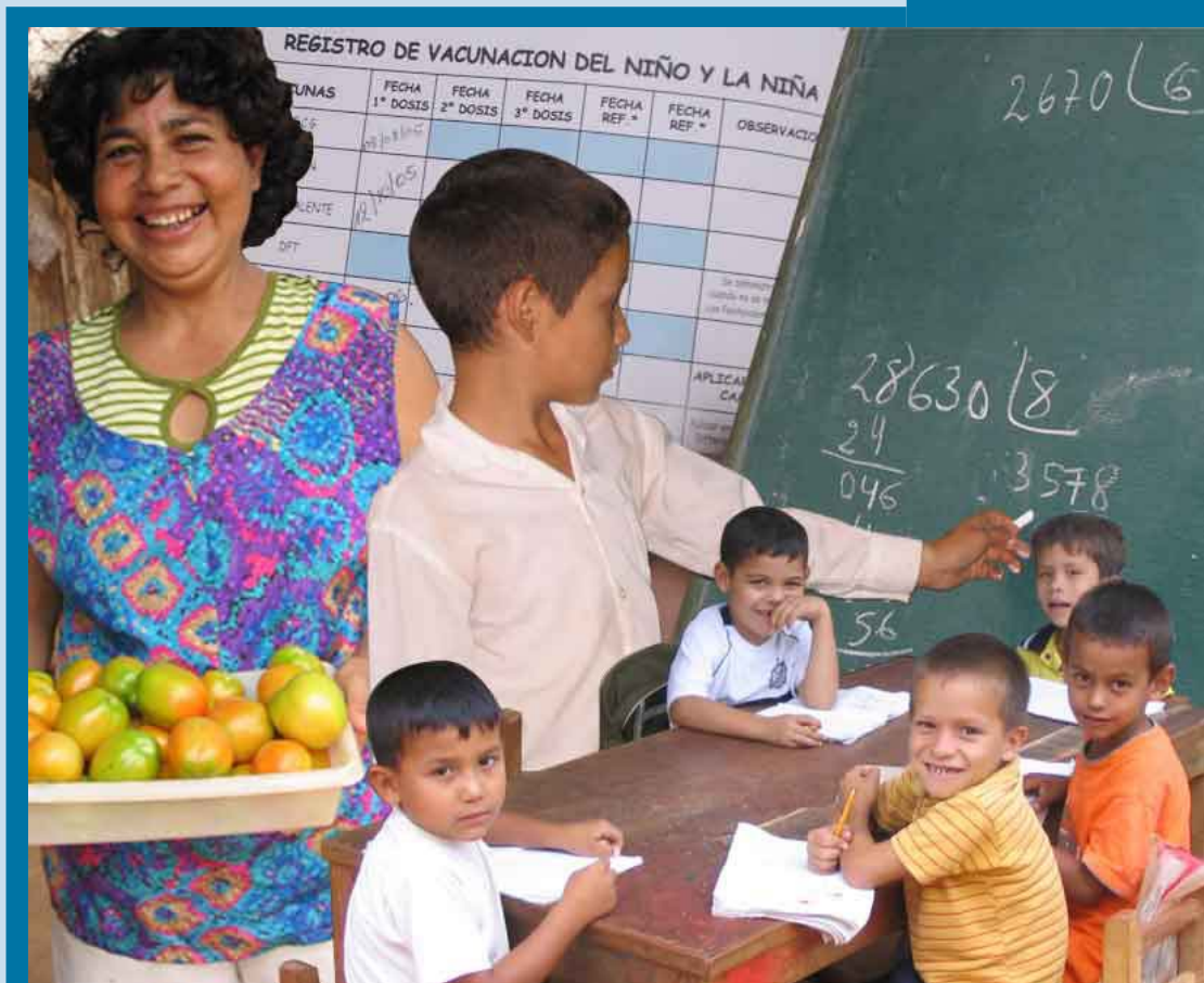
Tekoporã beneficiary family and school children in Paraguay.